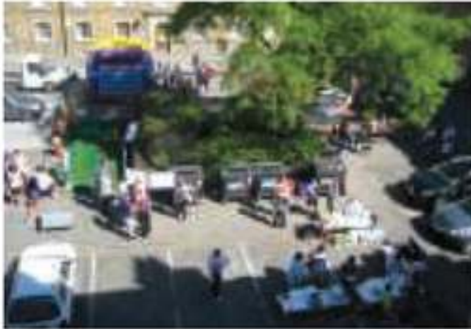
Temporary landscape at Peabody Estate, Islington