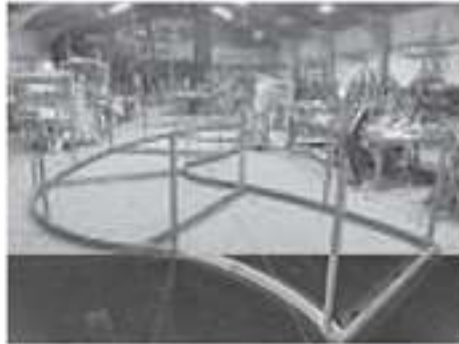
• Meanwhile Bridge