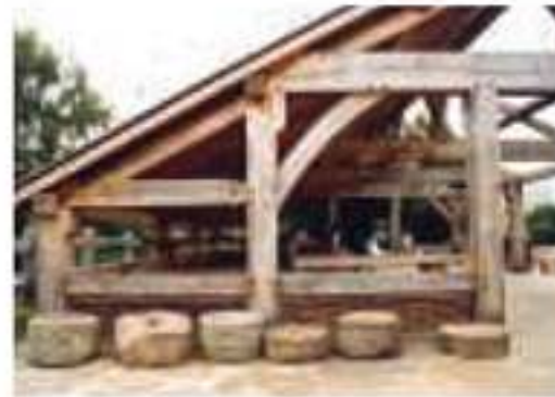
• Nottingham Castle