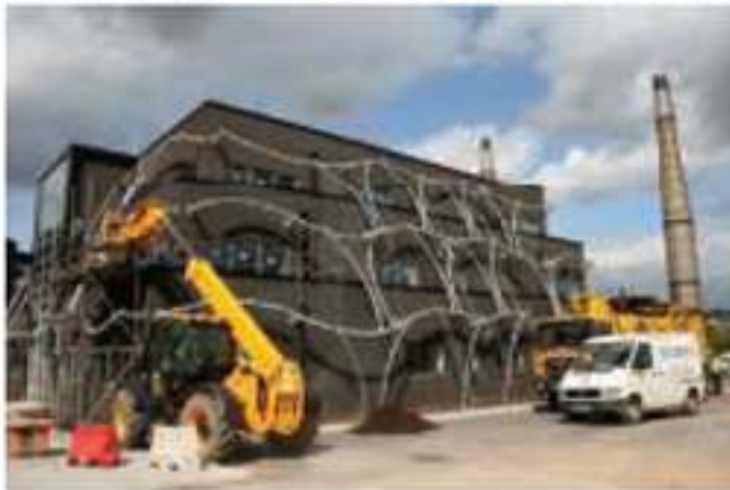
Metal wire and metal façade for greening Magma, Rotherham

What will emerge will be ideas for temporary landscapes, structure, buildings,