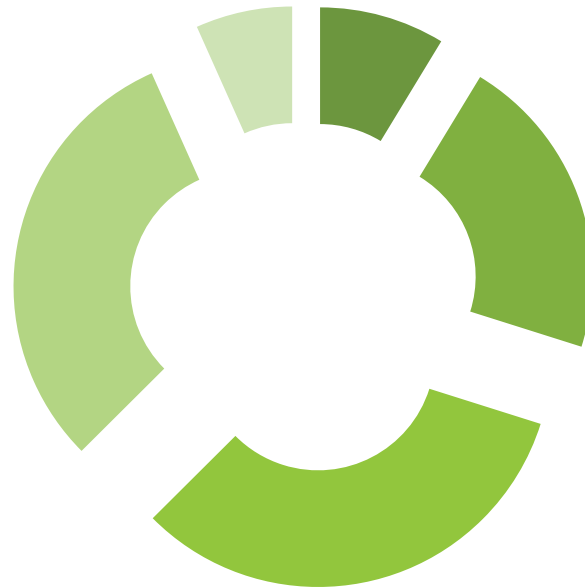
FREQUENCY OF EATING OUT

■ never ■ 1 x month ■ 1x week ■ 2-6 x week ■ daily ■ never ■ 1 x year ■ 1 x month ■ 1 x week ■ 2-6 x week ■ daily